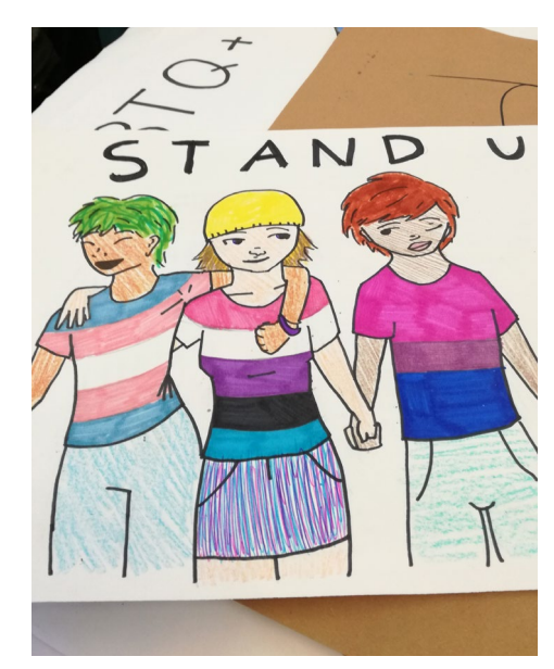
Artist: Marlowe North

For the past 10 years, schools across Ireland have devised creative activities to mark Stand Up Awareness Week such as walls of supportive messages, rainbow chains, a zebra crossing, and an assembly of songs by LGBTI+ artists and allies. Check out these photos and the hashtag #StandUp19 for some inspiration.